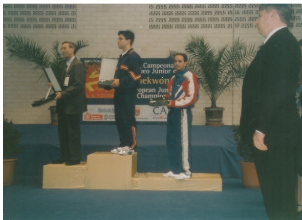
3 rd place team during European champ.