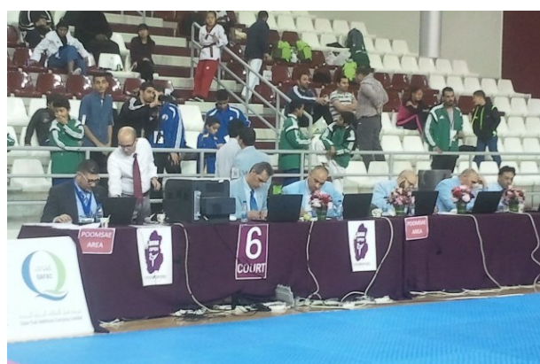
Poomsae referee Chairman in Qatar 2015