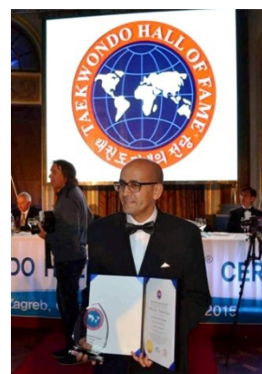
Hall of Fame 2015