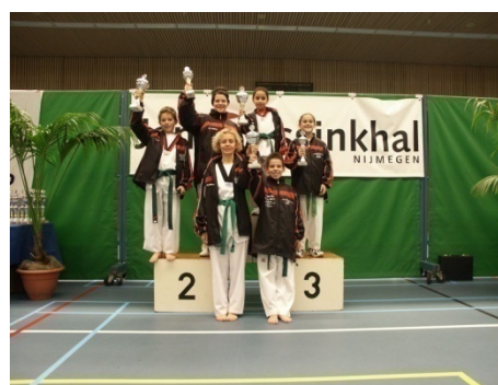
and Poomsae team