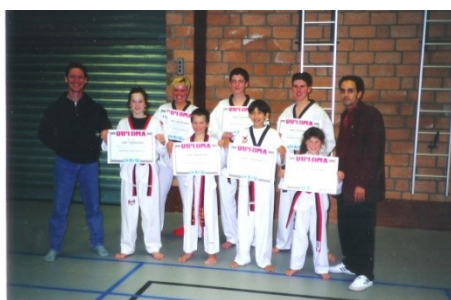
club members who passed the geupexam