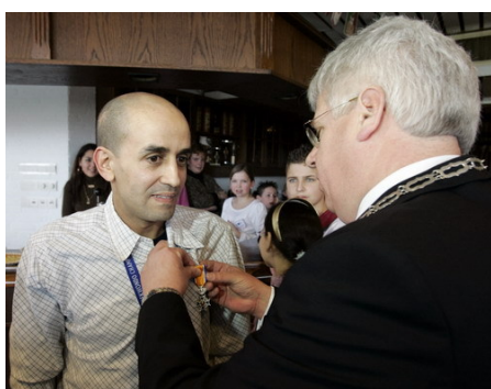
Received a very special from our Queen of the Netherlands