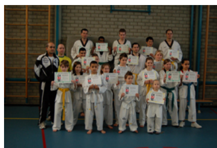
club members who passed the black belt exam (Dan/Poom)