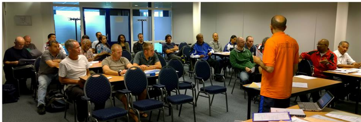
Above some pictures of referee seminar in theory / practicum, I gave to Dutch and Belgium Poomsae/Freestyle Referees

And more, I am active as a poomsae/freestyle referee and as a supporter in the following countries: Netherlands, Belgium, Germany, Austria, Spain, England, Poland, Luxemburg, Denmark, Finland, Portugal, USA, Canada, Italy, Serbia, France, Morocco, Park Pokal, Turkey, Qatar, China, Taipei, Korea and more→.