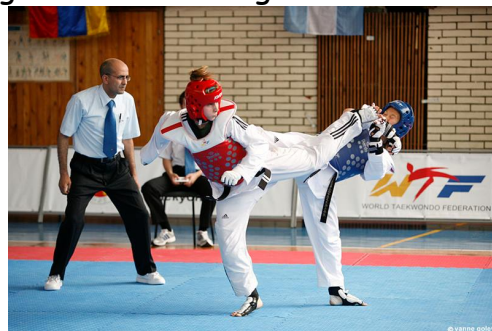
Ref. during World Deafychampionship 2013