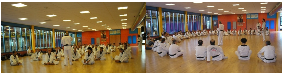
Dutch and Belgium Poomsae/Freestyle Referee corps