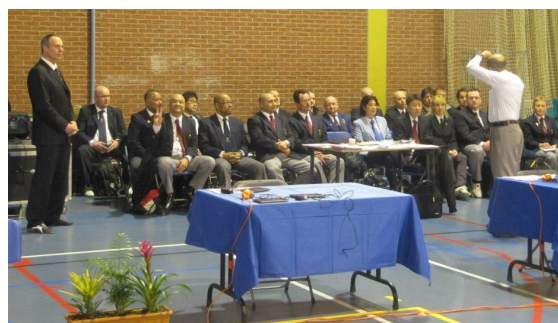
Referee Briefing during Belgium Open Poomsae/Freestyle Technical meeting during Belgium Open