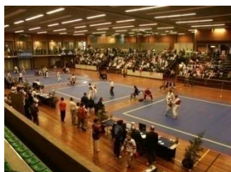
(First Day) Kyorugi (sparring)

Few years ago, I organized the Masters Cup for the 7th time. It's an successfully international A-classed tournament in Kyorugi (sparring) from 2nd geup and technical (poomsae) from 1st Dan/Poom and highbreak and powerbreak, Hanbonkyorugi, Hosinsul, poomsae with music, speedbreak for pupils, starters, juniors and seniors. This tournament is nationally as well as internationally acknowledged as organizational high classed. National teams of Austria, Denmark, Belgium, France and Czech Republic took part in this tournament. Other participating countries were Israel, Italy, Luxembourg, Poland, San Marino, Switzerland, Ireland, USA, Belarus, Lithuania, Germany, Portugal, Spain, Azerbaijan, Nigeria, Tanzania, Zimbabwe, Albania, Turkey, Morocco and of course The Netherlands. Also because of the help of volunteers of our club and of the municipality Sittard-Geleen, it became a successful tournament.