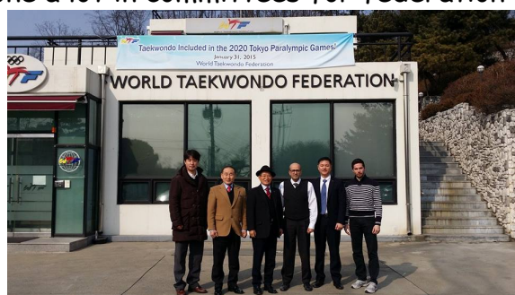
Committee meeting in Korea