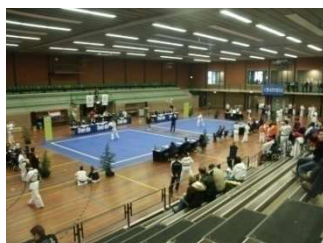
(second Day) Technical poomsae/Freestyle/ Hanmadang